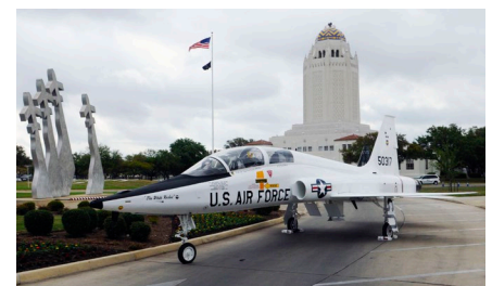
The JBSA-Randolph Tower is the headquarters for the 12 th Flying Training Wing (top). T-38 "White Rocket" is on display in front of the 12 th Flying Training Wing Headquarters at JBSA-Randolph (bottom).